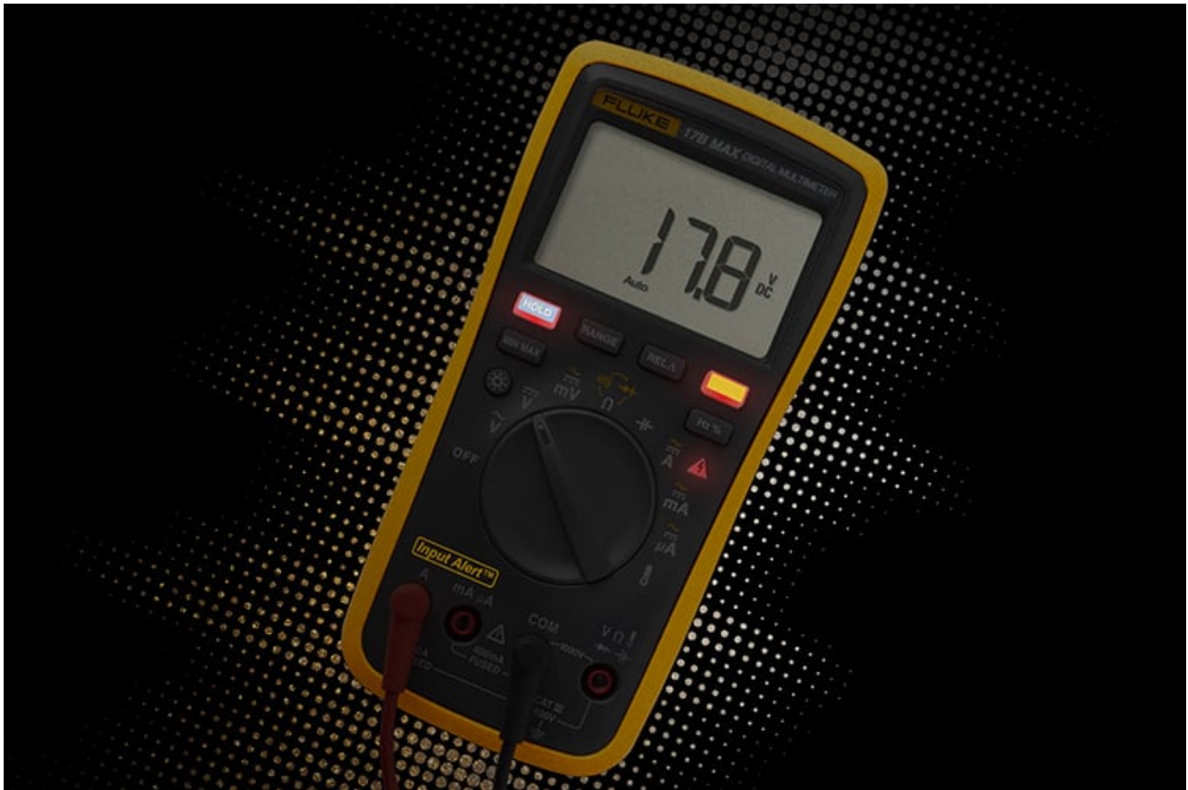
Audible and visual alarm for incorrect connections